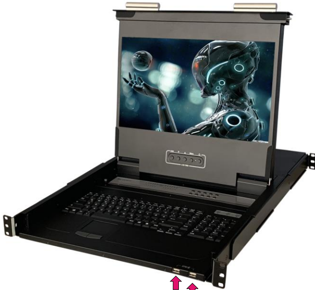
USB port for Keyboard/Mouse

Optimize rack space. Maximize rack monitoring